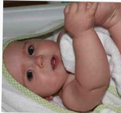
LOOK AT MY TEETH!!