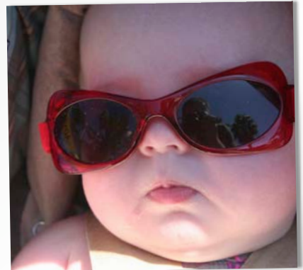
CHILLIN' IN FLORIDA